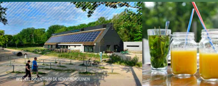
BEZOEKERSCENTRUM DE KENNEMERDUINEN